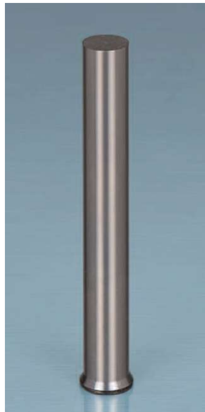
Tabelle zu 312.

312.1000.080 Schneidstempel DIN 9861 Form D, HSS D1 = 10,0 mm L = 80,0 mm