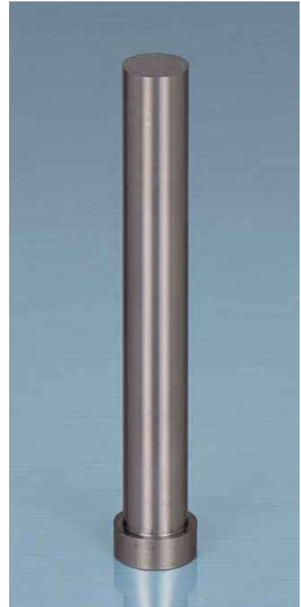
Tabelle zu 512.