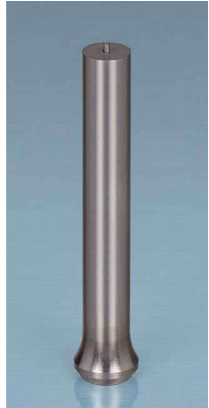
Tabelle zu 912.