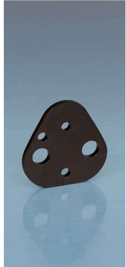
Tabelle zu URBP.